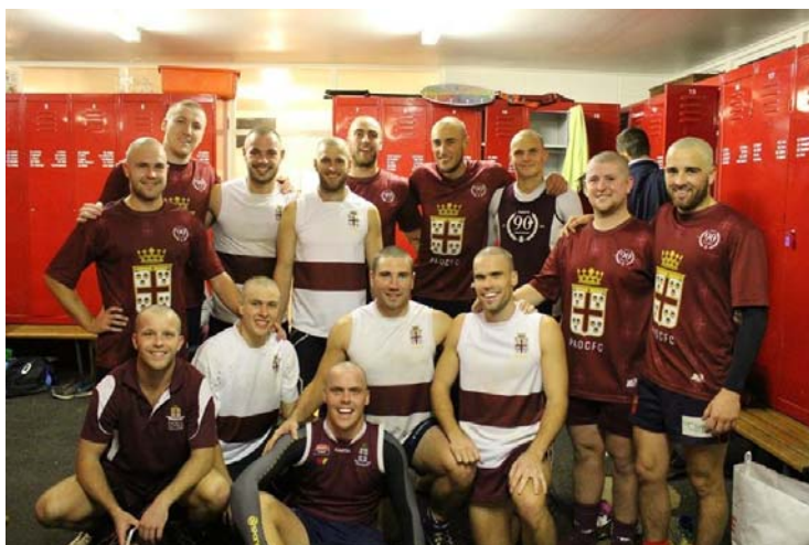
Throwback to Little Eddie's fundraising efforts last year.